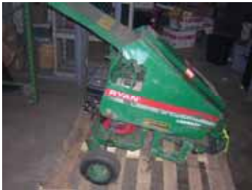
Ryan LawnAire 28;