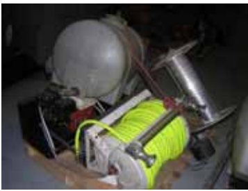
Pump, motor, tank, 2 reels;