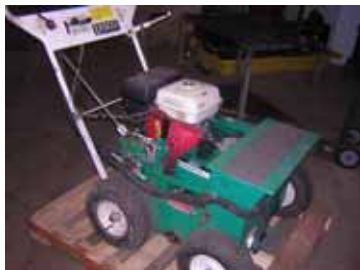
Lesco Renovator 20