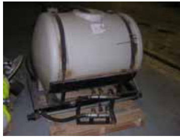
140 gallon tank;