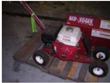
Brown bed edger;