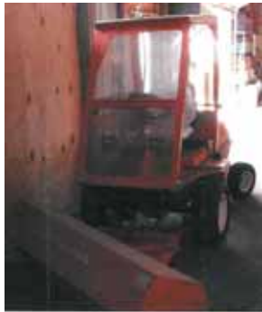
1989 Jacobsen Turfcut C420G with sweeper;