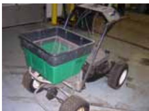
Lesco ride on spreader;