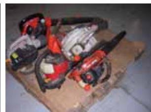
Misc. blower parts;