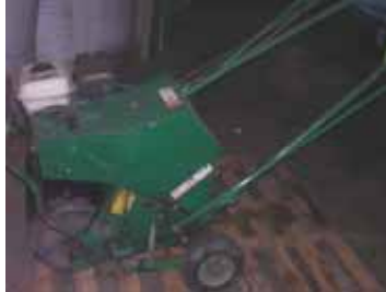
Ryan Lawn Aire V;