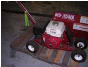
Brown bed edger;