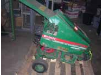
Ryan LawnAire 28;